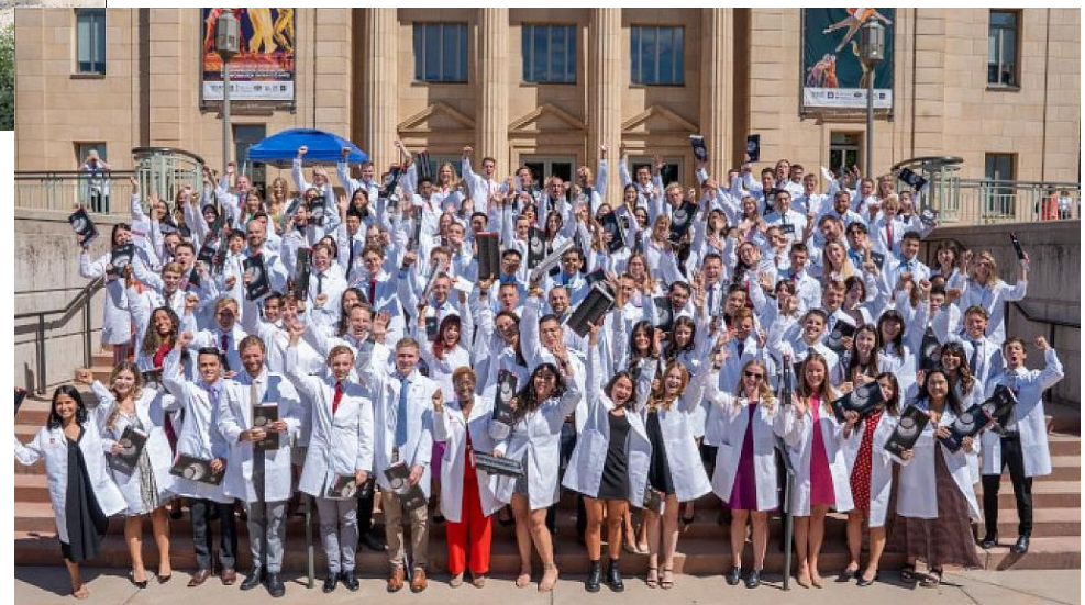
Class of 2027 White Coat Ceremony